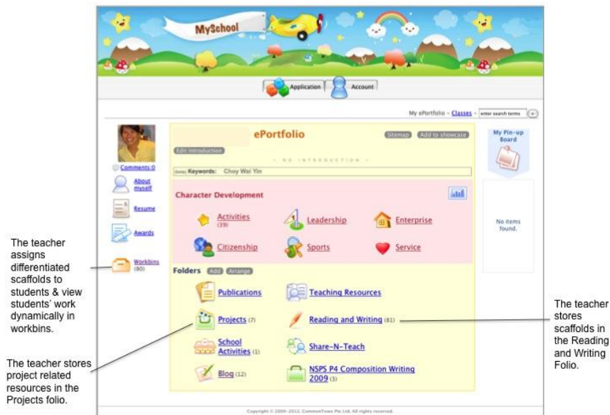
Figure 1. Features of e-portfolio.