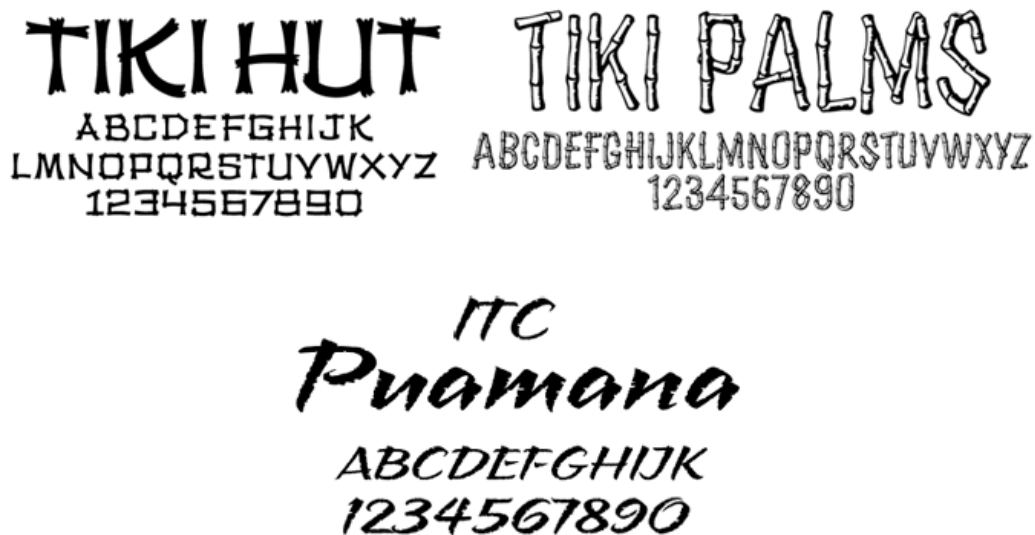
Figure 4: Typefaces Tiki Hut, Tiki Palms and ITC Puamana

Typefaces can indeed "visually reflect very closely the time and place in which they were made" (Antonelli). One well-known example of a 'tropical' typeface is the family of eight island-inspired Tiki Type fonts created by the type foundry House Industries. The designs for Tiki Hut, Tiki Wood and Tiki Palms, for example, were influenced by the place, history and culture of the Polynesian islands (Borden). Another typeface is the ITC Puamana, designed by Teri Kahan, which is described as capturing "the essence of the tropics, suggesting palm trees bending in an ocean breeze" (Haley 1) (Figure 4).