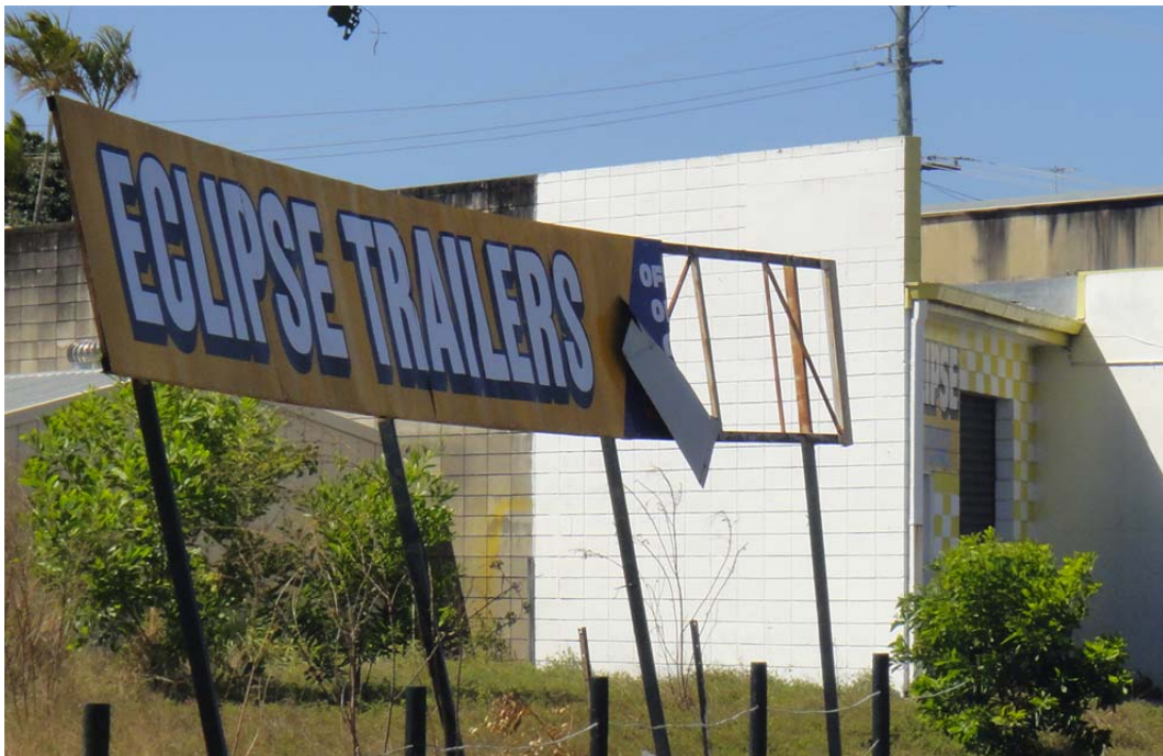
Figure 9: Climatic event left its trace