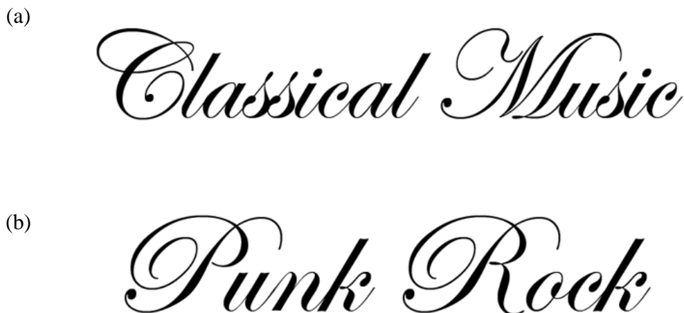
Figure 1: The elegant flow of harmonious and fluid lines which characterizes the typeface ITC Edwardian Script intensifies the meaning of word (a) whereas in (b) the same typeface undermines the meaning and may confuse or disturb the reader.

properties (the formal) (Ruder 14). These properties “dramatically affect the accessibility of an idea and how a reader reacts towards it” (Ambrose and Harris, Fundamentals of Graphic Design 38). They establish a resonance in the reader, which can be either inviting or repelling (Meggs 18). “The visual nature of typography is extraordinary for it can combine the time-space sequence and rhythm of music, the linear structure of language, and the dynamic space of painting” (Meggs 18). A typeface has its own personality which can infuse text appearing on a screen, a poster or a wall (Ambrose and Harris, Fundamentals of Typography , 162). The artistic representation or interpretation of characters can thereby intensify or contradict the meaning of words. This relationship between aesthetic form and semantic content is demonstrated by the example shown in Figure 1.