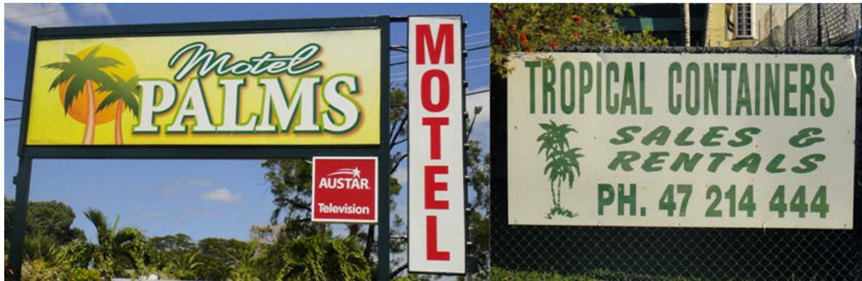
Figure 6: Signage with figurative elements

In search for Townsville’s typographic identity, made up of signage and lettering on walls, shops and other environmental signage, Townsville appears shy at first sight in advertising its tropical location. In contrast to Hawaii, distinct tropical typefaces such as the Tiki fonts or ITC Puamana are absent from the lettering and signage landscape in Townsville. However, it is not difficult to turn up signage with figurative elements including palm trees, the sun, or ocean wave, giving away its location (Figure 6).