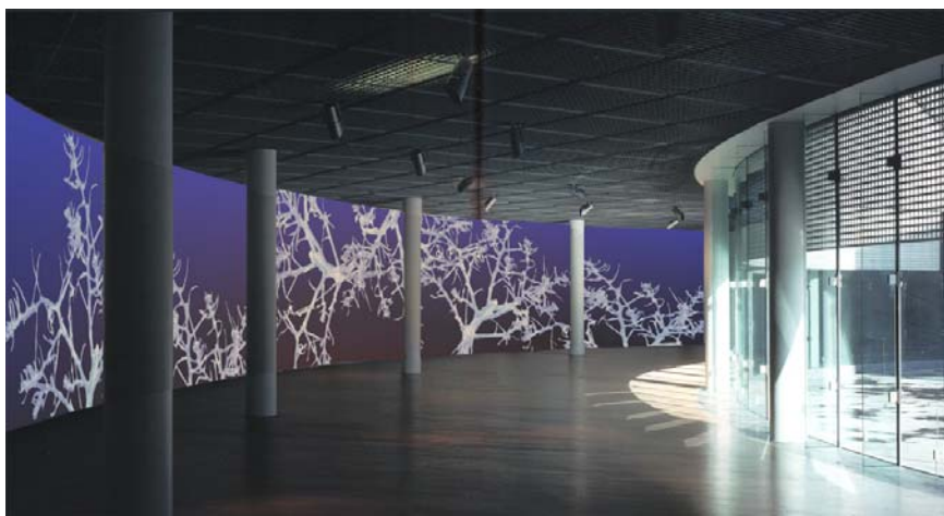
Figure 1. Myriophyllum glomeratum , Virtual wall installation 2003. Digital image, 40cm x 21cm.

From this time, I started researching extinct plants and I produced a body of digital images with the intention of creating live art as shown in Figure 1. My aim was to project gently moving images onto interior walls to emulate the movement of the sun and clouds and the changing light conditions like that I experienced in the natural environment. Technological limitations and prohibitive cost culled this plan, so I searched for alternative techniques to convey my concerns. I commenced a body of hand stitched pieces on organza which is designed to cast shadows on the gallery wall. There is a disquieting aspect to the shadows that are both absent and quietly beautiful, much like the extinct plants I was seeking to represent.