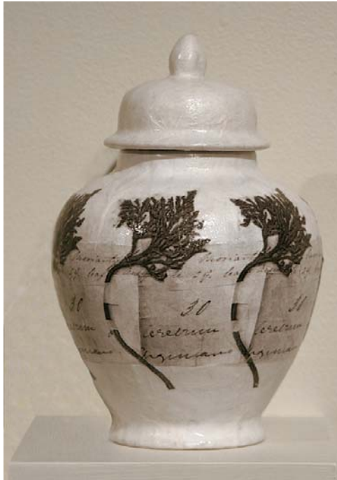
Figure 2. Funeral urn for Botrychium austral 2006. Ceramic, digital image, glaze. 20cm x 10cm x 10cm