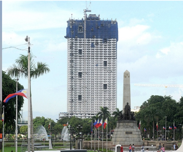
Figure 4. Construction of the controversial Torre de Manila condominium behind the Rizal Monument in Manila (Directo, 2015)