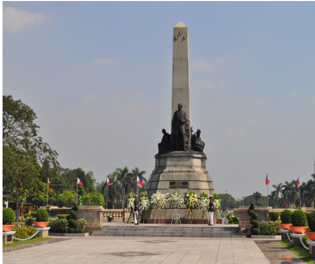
Figure 3. The Rizal Monument in Rizal Day 2009 https://commons.wikimedia.org/wiki/File:Rizal_Monument_on_Rizal_Day.jpg Public domain.

Ultimately, the heritage claims were heard and in June 2015 the Supreme Court of the Philippines issued a temporary restraining order, suspending Torre de Manila's construction. Shortly after, the Solicitor General, Florin Hilbay, arguing that the Rizal Monument's physical integrity necessarily includes its sightline, issued a memorandum asking the Supreme Court to order DMCI Homes to demolish Torre de Manila at its own expense.