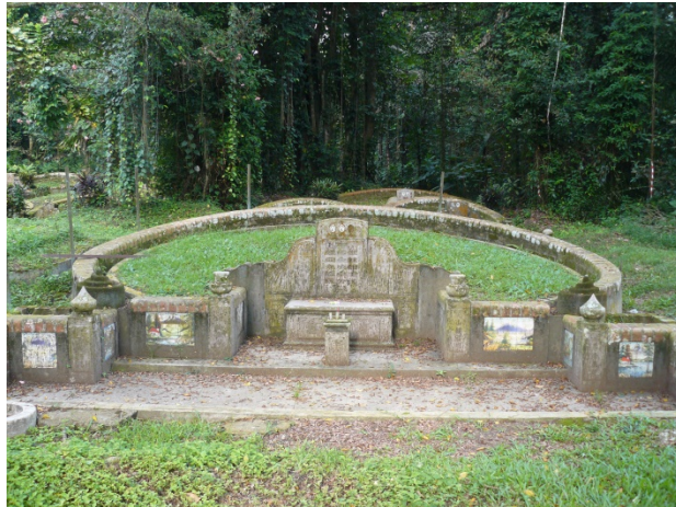
Figure 5. Shrine at Bukit Brown Cemetery (Author's photograph, 2017)

Brown Cemetery , by the National Heritage Board, Roots: a Documentary on Bukit Brown , by Singapore Polytechnic); exhibitions ( The Bukit Brown Index ); 8 theatre plays and performances; 9 and dedicated websites by heritage groups ( All Things Bukit Brown ( http://bukitbrown.com ), and SOS Bukit Brown ( https://sosbukitbrown.wordpress.com/ )). 10