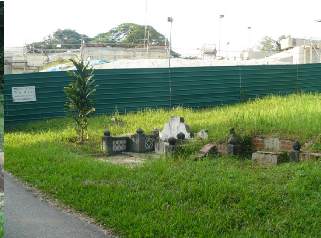
Figure 6. Construction of the eight-lane highway at Bukit Brown Cemetery