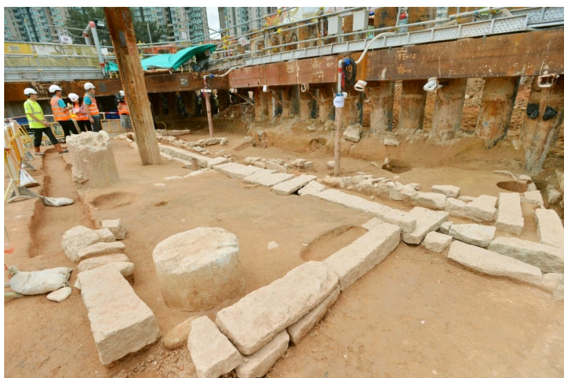
Figure 1 Archaeological site in the the area around the MTR's new To Kwa Wan station (South China Morning Post, 2014)