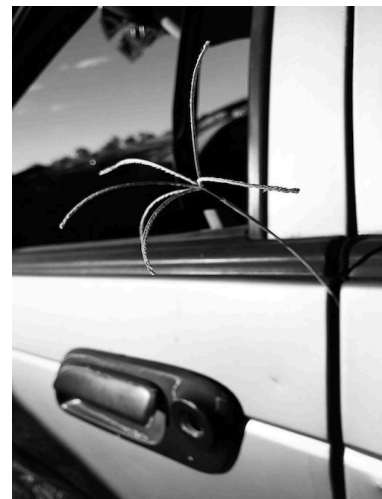
Figure 9. Yuelamu 7