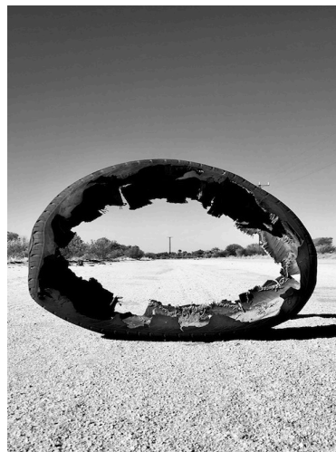
Figure 8. Tanami Highway 3