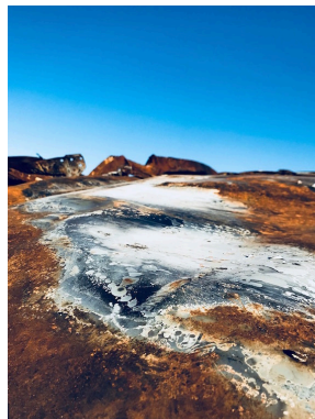
Figure 3. Yuelamu 2