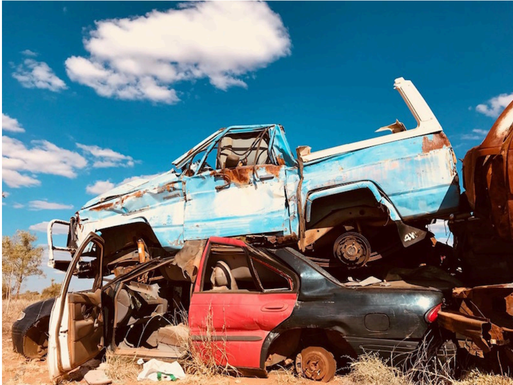
Figure 1. Old Mt Allen Pastoral Lease