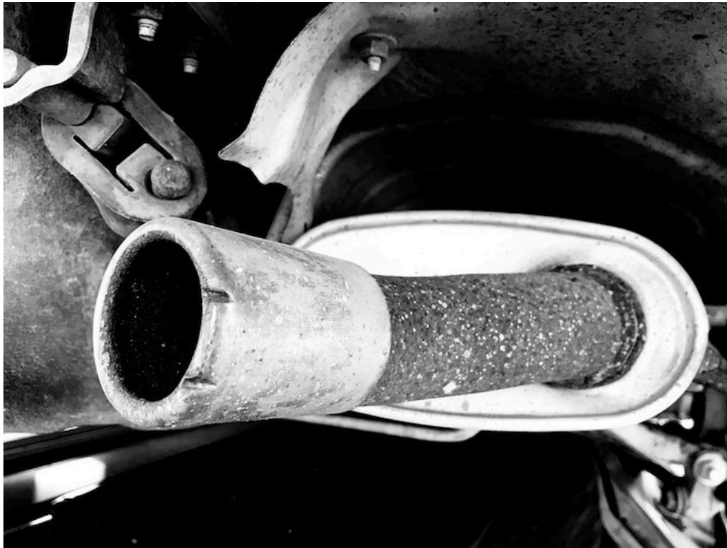
Figure 6. Tanami Highway 2