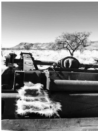
Figure 7. Santa Teresa 3