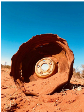
Figure 2. Tanami Highway

new testament motor_car_come motor_car_leak motor_car_stop motor_car_prickles 1 motor_car_burn motor_car_sleep motor_car_rust motor_car_steel