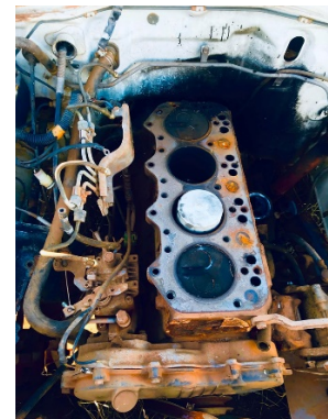
Figure 5. Yuelamu 3