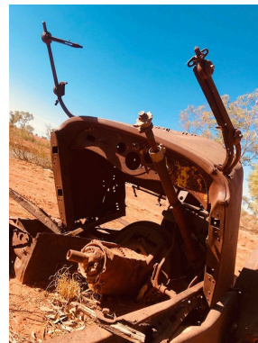
Figure 4. Titjikala 2