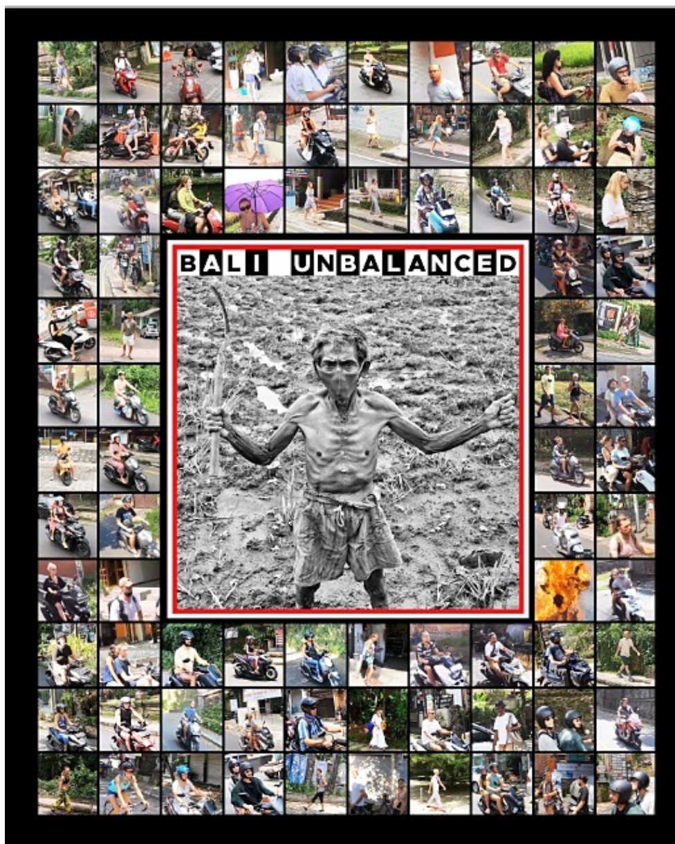
Figure 1. Bali Unbalanced

Source: John Logan, 2021. Photographs, printed on billboard. 2.5 x 2.0 metres.