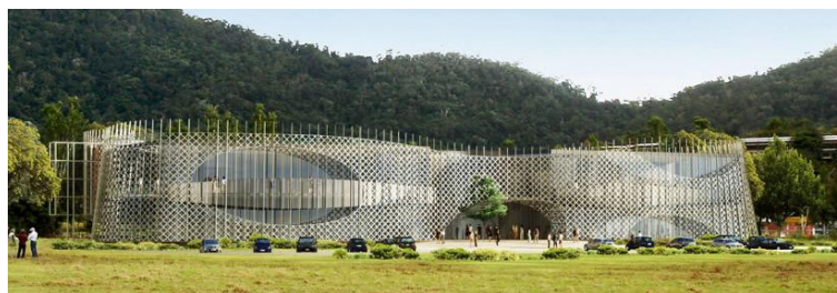
The Cairns Institute, James Cook University, Smithfield, N. Qld. Australia

Editor, etropic Convenor, Tropics of the Imagination Conference