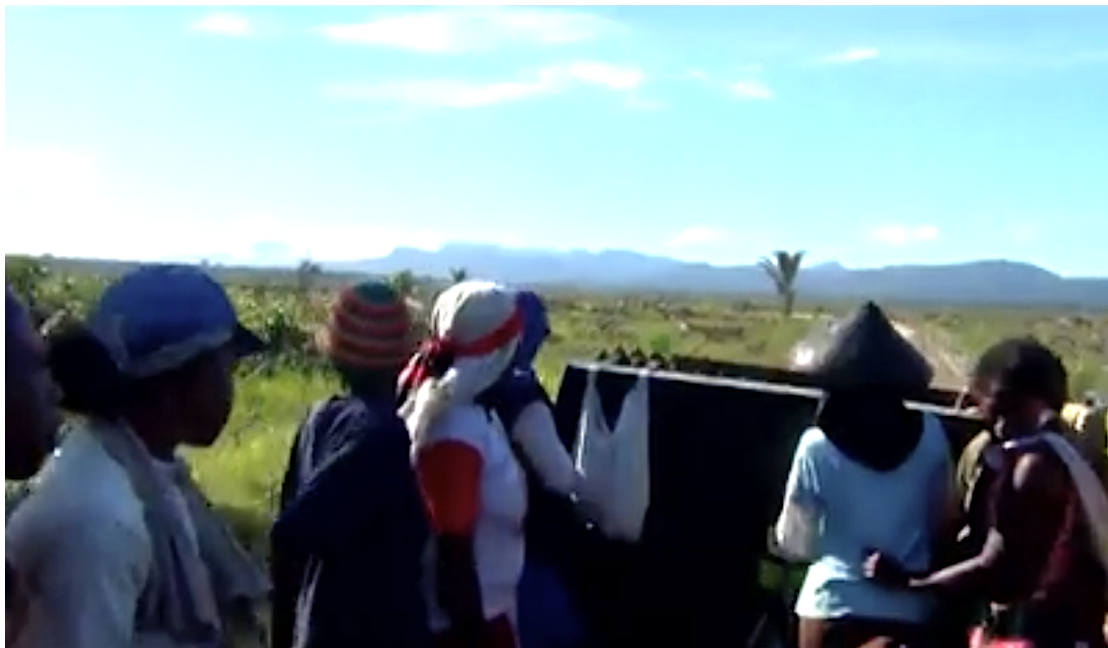
Figure 2. Women are loaded into a truck to work in the palm plantation.

The front view is the open cleared forest where the forest garden for women's work and sociality used to be.