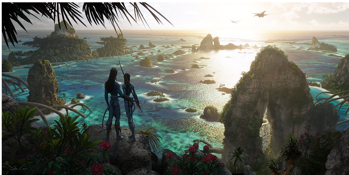
Official Avatar 2 concept art