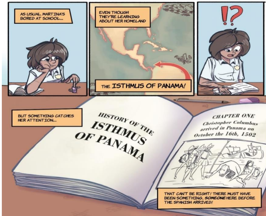
Figure 1. Martina and the Bridge of Time