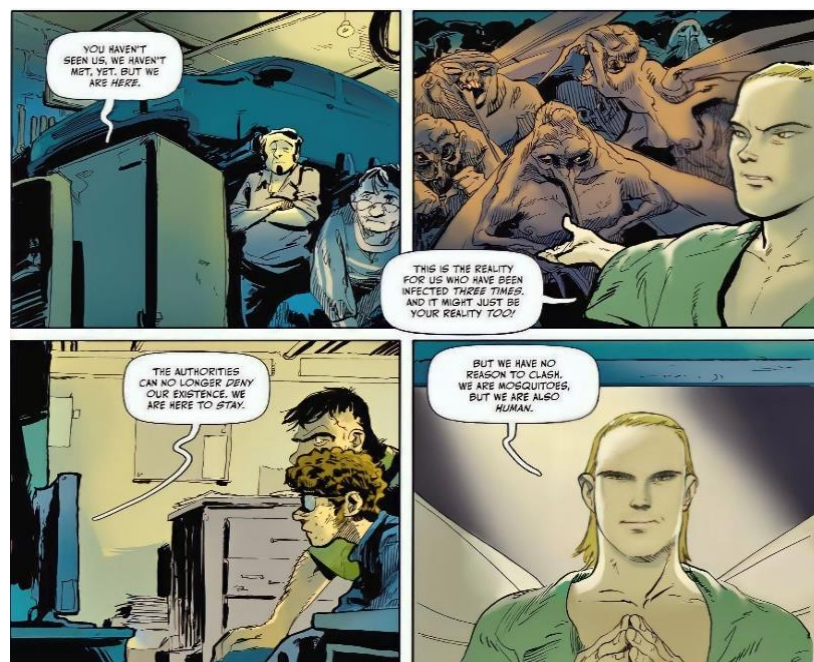
Figure 2. Dengue

In this panel, the post-human hybrids advocate for cooperation and peaceful survival. (Santullo & Bergara, 2015, Book I, p. 23). Reproduced with authors' kind permission.