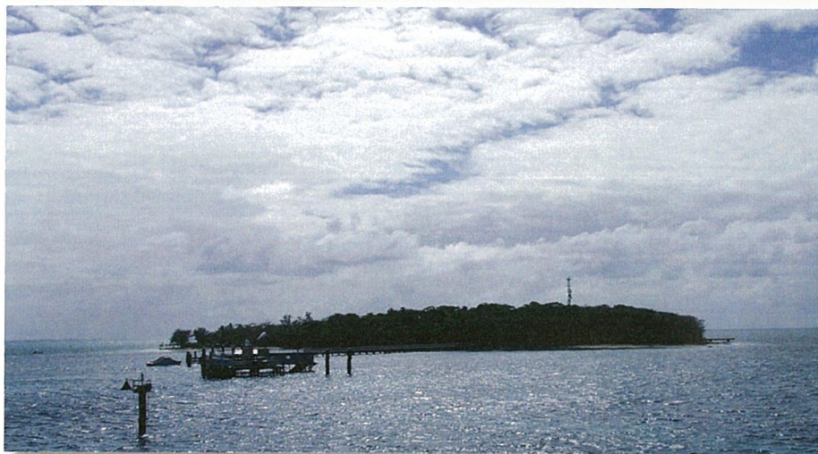
top: Jetty leading to Green Island 1932. bottom: Green Island 2009