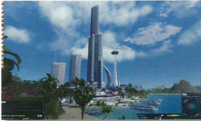
Entropia Universe: Port Atlantis (screen shot 11.11.2011)

Entropia Universe (EU) is a Massively Multiplayer Online Role Playing Game (MMORPG/MMO) based in multiple virtual worlds. The game was launched in 2003 and now has an estimated population of approximately 1 million registered users worldwide. The game world consists of a three dimensional computer generated environment, where players from around the globe interact via humanoid avatars. The virtual universe is comprised of multiple planets, run as franchises by different software companies. The original and most densely populated planet is Calypso and this is where the bulk of my field research, on the nature of being in virtual space, is taking place. The primary method of investigation is online ethnographic participant observation, complemented by semi-structured interviews with other players. The field work began in August 2011 and will continue for approximately 12 months.